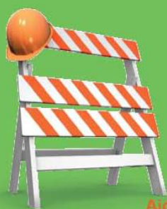
Aide-mémoire to keep

The 3-1-1 service is not an Information Service, nor is it managed by municipalities . This is why the telephone numbers of each municipality remain the same.