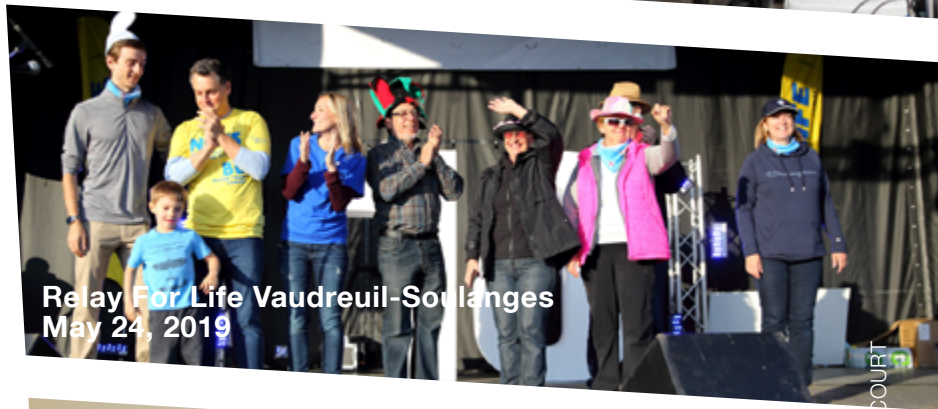
Relay For Life Vaudreuil-Soulanges May 24, 2019

Always attentive to your needs, your Town Councillors attended various events held throughout the year.