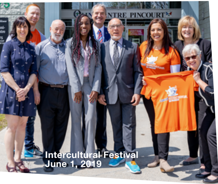
Intercultural Festival June 1, 2019