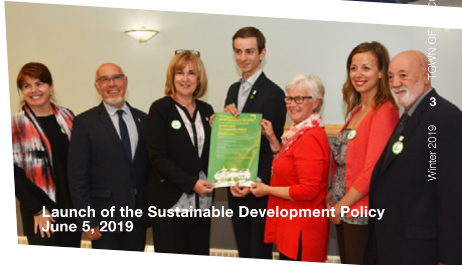
Launch of the Sustainable Development Policy June 5, 2019