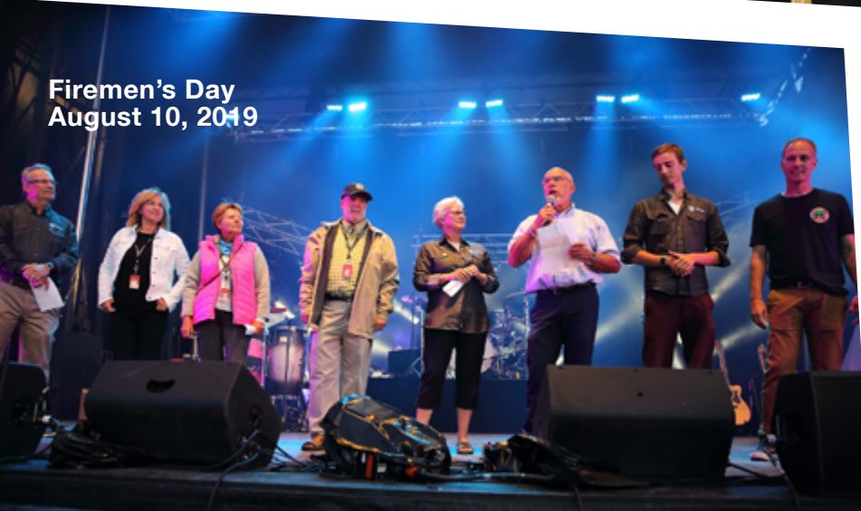
Firemen's Day August 10, 2019