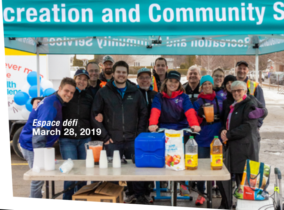
Espace défi March 28, 2019