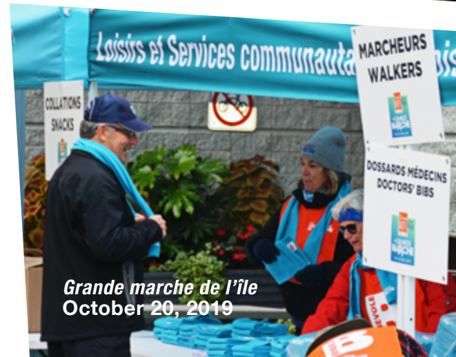
Grande marche de l'île October 20, 2019