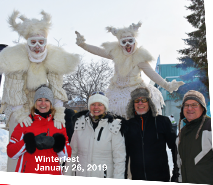
Winterfest January 26, 2019