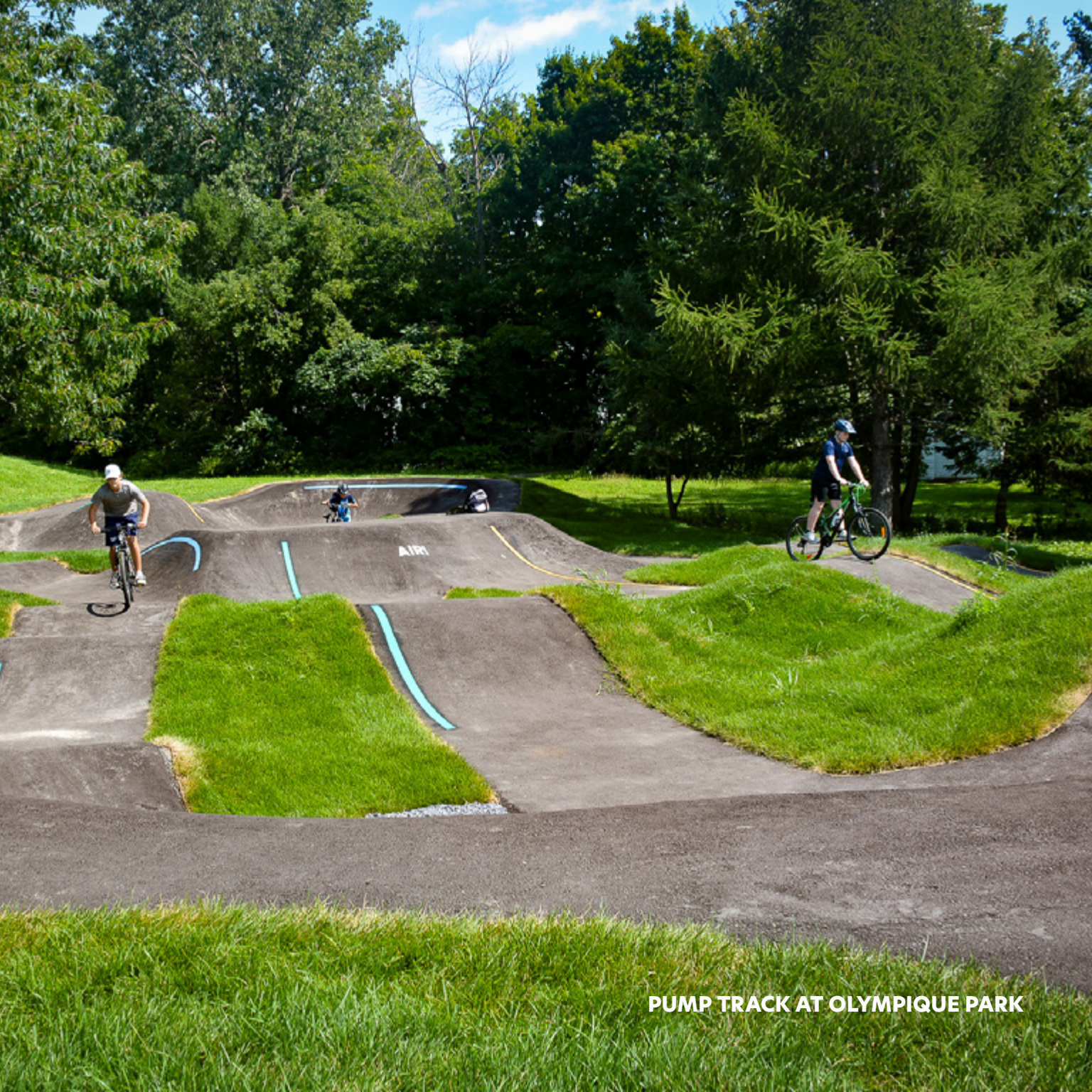
PUMP TRACK AT OLYMPIQUE PARK