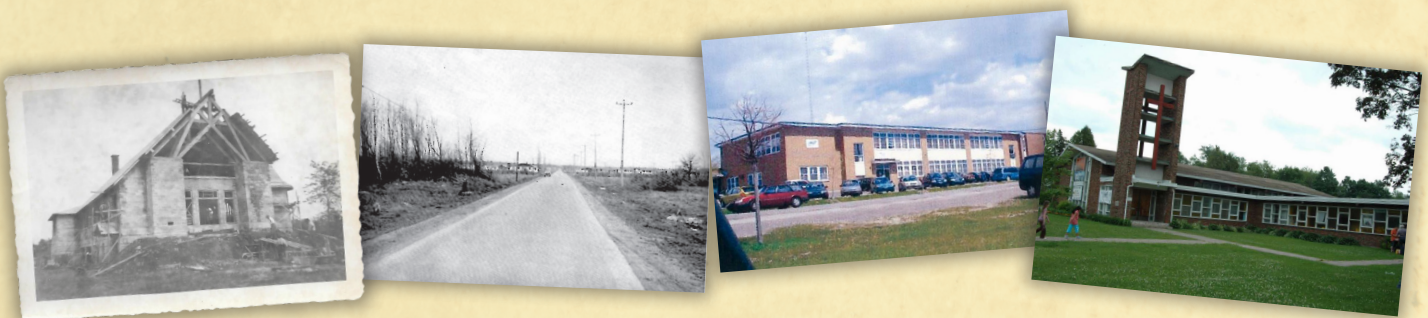
Pictures from left to right: Notre-Dame-de-Lorette Church • Cardinal-Léger Boulevard • Notre-Dame-de-Lorette School in 1964 • Presbyterian Church of Ile Perrot