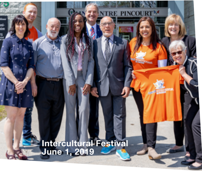
Intercultural Festival June 1, 2019