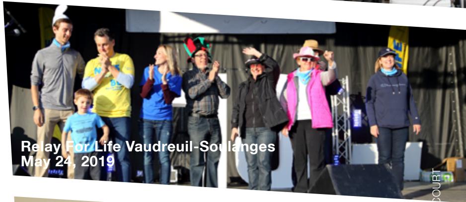
Relay For Life Vaudreuil-Soulanges May 24, 2019

Always attentive to your needs, your Town Councillors attended various events held throughout the year.