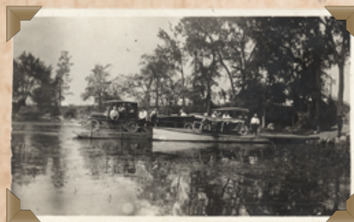
Pictures from top to bottom: Hamel grocery store, nicknamed "Le petit château" (the little castle), opened around 1946 in the Pointe-aux-Renards area • School chapel: An annex was built onto the school in 1929 and used as a chapel for the next 23 years. • CN gateway • The LaFlèche ferry