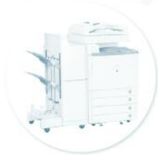
Print and copy center